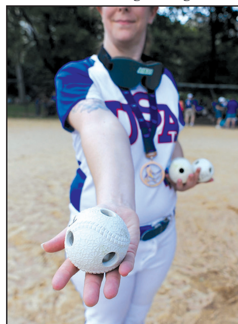
Player demonstrates special ball with bells inside.

who were there to learn and experience the game. Participants also gave a rousing cheer after an announcement about a new soon to be favorite New York sports team – The Lighthouse Guild Lightning. The