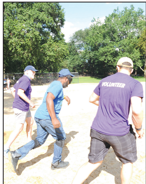
Player, center, is escorted on the field.

who were there to learn and experience the game. Participants also gave a rousing cheer after an announcement about a new soon to be favorite New York sports team – The Lighthouse Guild Lightning. The