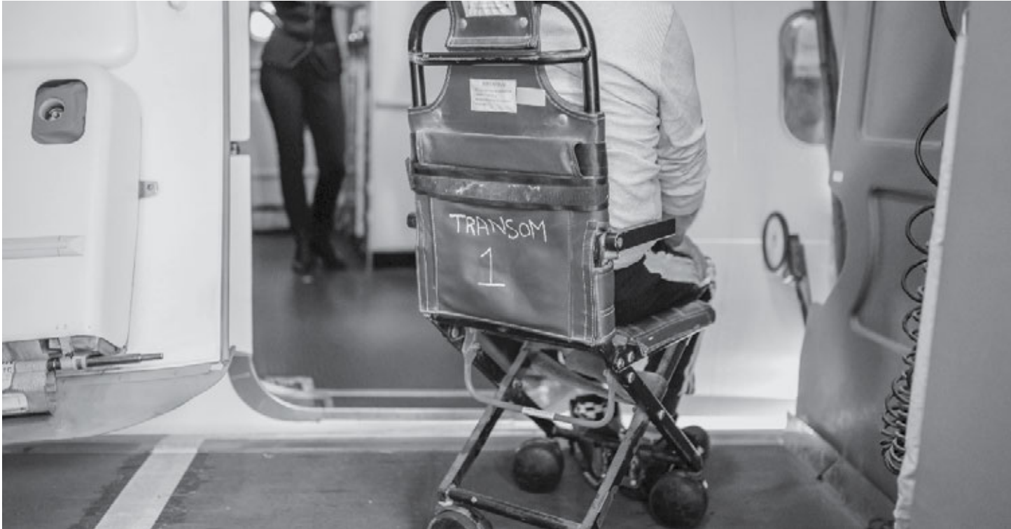
Photo: A person sitting on an aisle chair waiting to board an airplane.

As disabled travelers' refusal to fly has surged in the last few years, the federal government is taking aim at airlines for mishandling wheelchairs, proposing to make damages and delays automatic violations of the Air Carrier Access Act (ACAA).