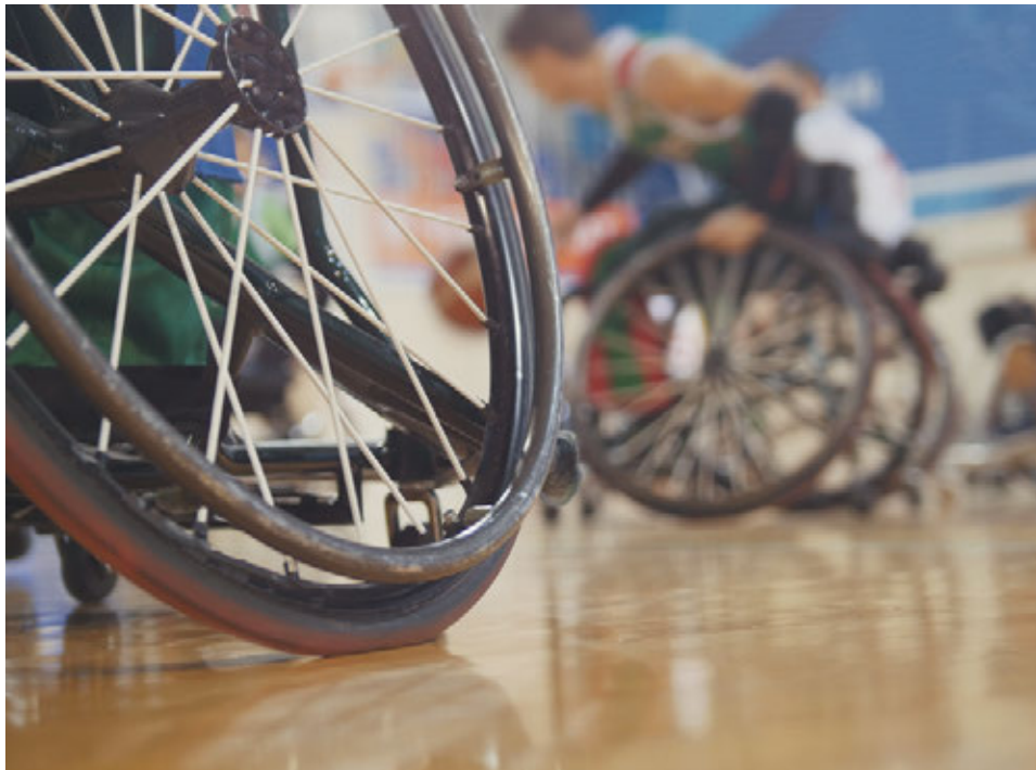
Wheelchair basketball players in action.