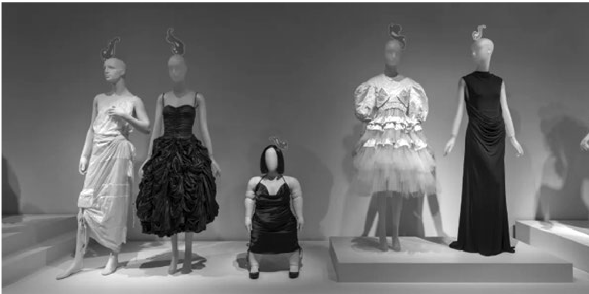
Photo from "Women Dressing Women" exhibit, courtesy of Christopher Alvarez.

In recognition of Women's History Month, The Metropolitan Museum of Art closed out its "Women Dressing Women exhibit" by hosting a panel of experts and advocates working in the fashion industry to discuss accessibility, sustainability, and the collective nature of design.