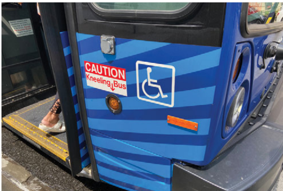
Photo: An accessible New York City bus.

The Metropolitan Transit Authority (MTA) recently announced details of two exemption plans that would allow people with disabilities and organizations that provide transport for people with disabilities to apply for an exemption from the central business district toll, known as congestion pricing.