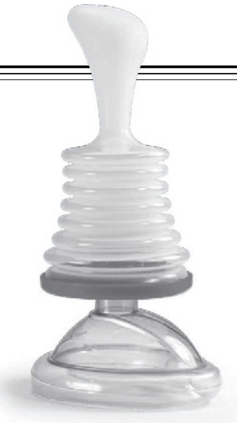
Photo: An accessible non-invasive airway clearance device.

As an ambulatory wheelchair user, spouse and parent of two able-bodied children, I am constantly trouble-shooting situations before they happen. Being prepared is the only option. The value of acquiring and having these anti-choking devices in our first aid kit is three-fold. If I am the person choking, I may not be able to position myself to have abdominal thrusts performed. Additionally, I may be with my young children who would not